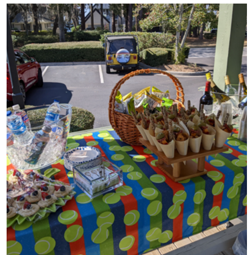
The ladies at the 3.5 40 + SCYC USTA Matches Member spectators and delectable spread of post-match refreshments at the 55+ SCYC USTA Match