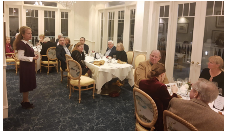
January Wine Society: Masi Winery in Valpolicella Classica | February Wine Society: Black Stallion

its international style. GRAPE VARIETIES Corvina, Rondinella, Osaleta.