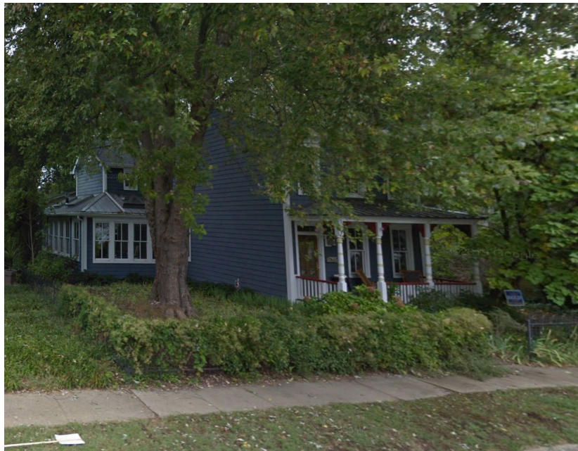
Harbor 20 Championship HQ – 110 Chesapeake Avenue